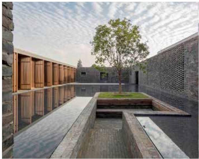
Arte Sella @Valsugana